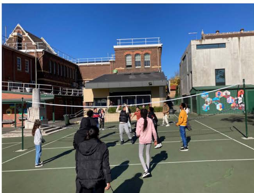
Students playing volleyball at Collingwood Campus.