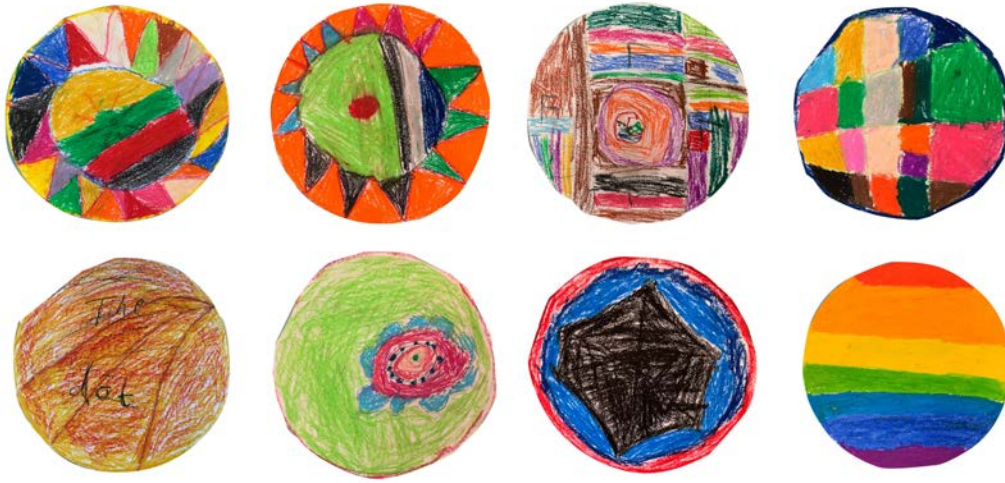
'The Dot' with P4, Craigieburn Campus