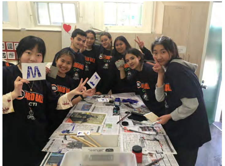
Secondary students from Collingwood Campus recently made lino-cuts in their art elective.